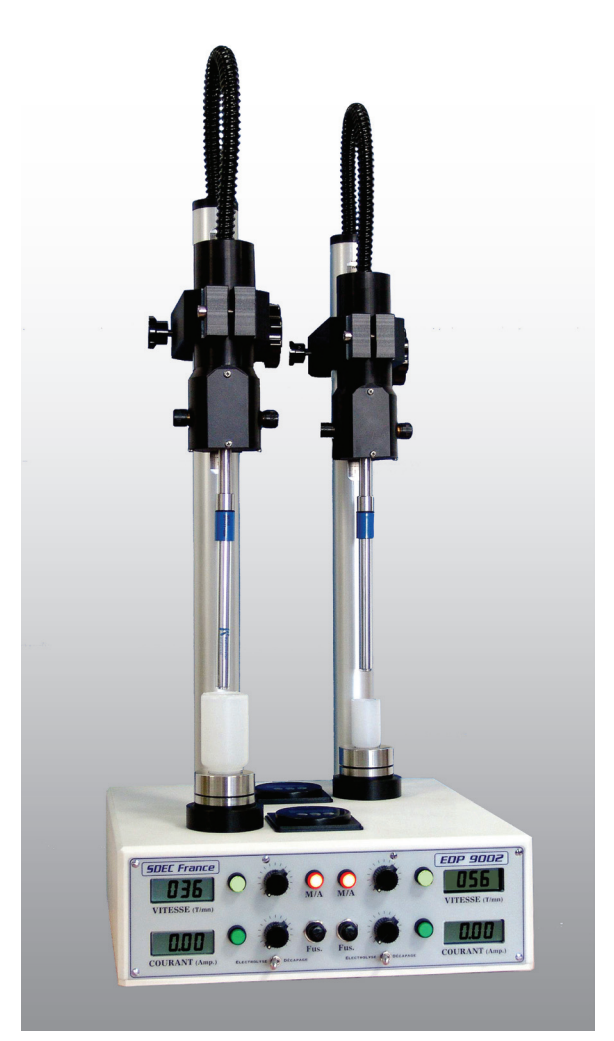
Dual channel electrodeposition device EDP 9002

- The advanced electronics of the power circuit is designed to provide high intensity (up to 5 amperes), far above normal operation level, allowing the equipment for an extended lifetime.