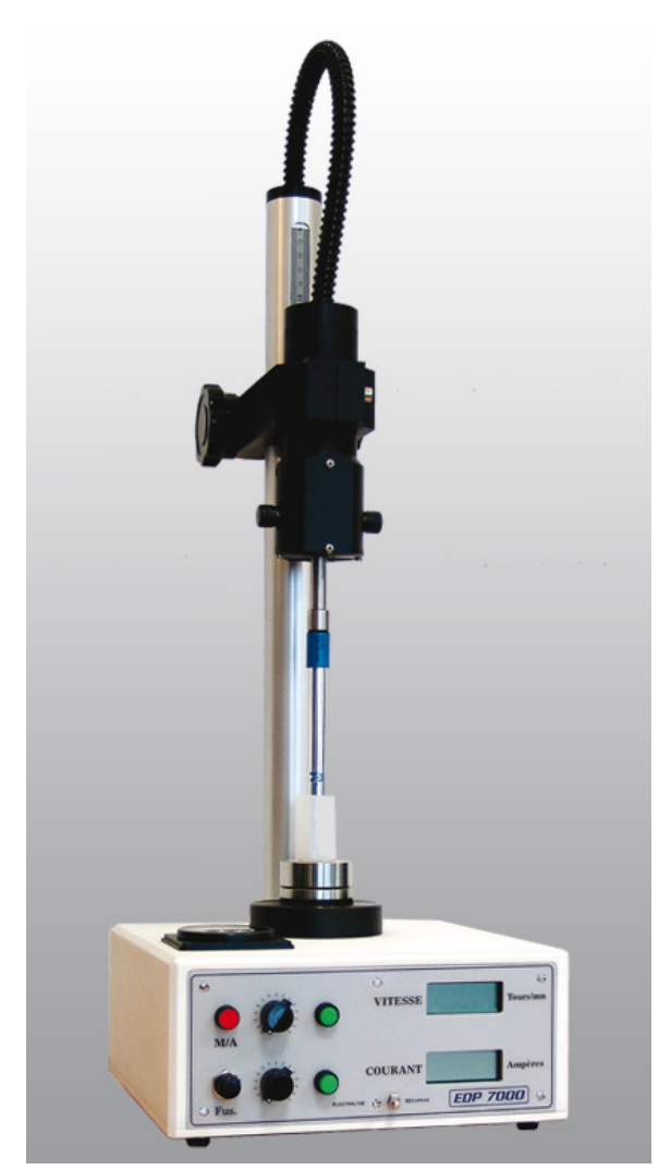
Single channel electrodeposition device EDP 7000

- Electrodeposition flasks: Capacity 20 or 50 ml in standard (open bottom flasks, ready for use).